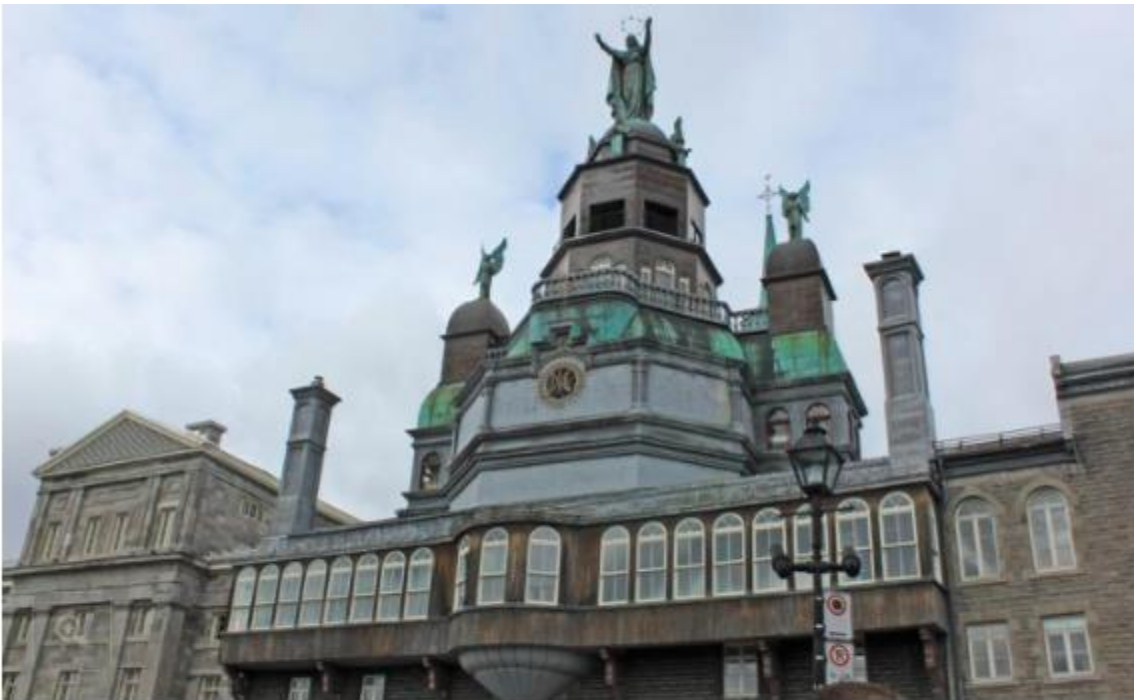
The statue of the Virgin Mary atop the Notre-Dame-de-Bon-Secours Chapel, in Old Montreal, is a landmark that appears in the Cohen song “Suzanne.”