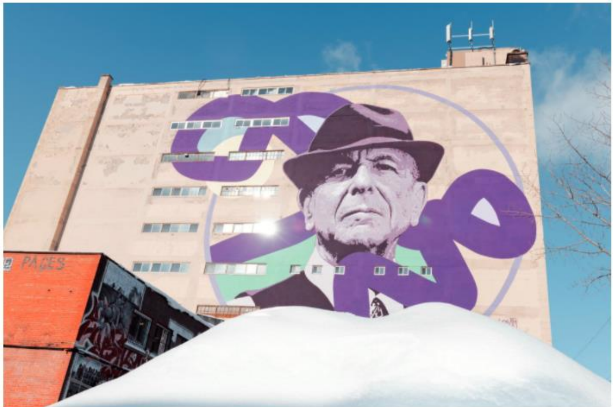
A mural of Leonard Cohen on a Montreal building.

MONTREAL — In an octagonal chamber at the Musée d'Art Contemporain de Montréal , a spectator in a trance-like state hums Leonard Cohen's "Hallelujah" as numbers on a digital display leap up to 631. That's how many people on Earth are streaming Cohen's version of the secular anthem right now, each represented by a recorded voice humming the song.