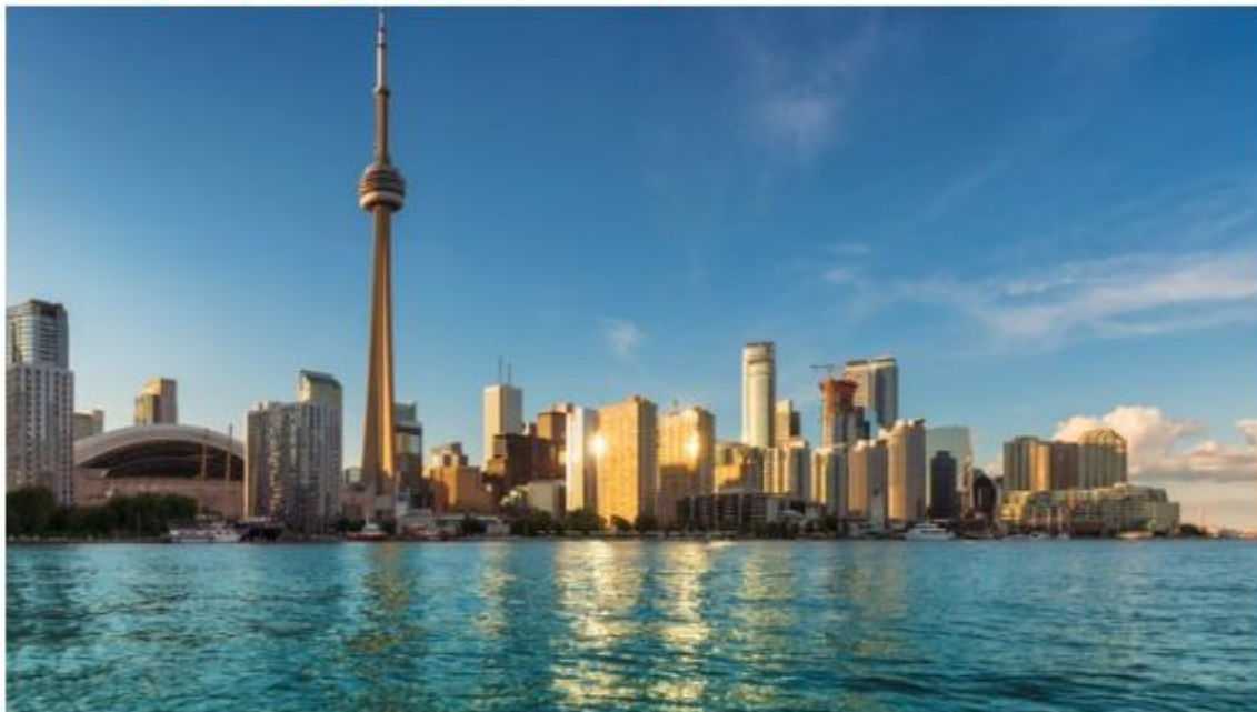
Toronto skyline at sunset, Canada.

It's time to make those summer travel plans.