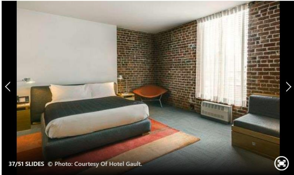
HOTEL GAULT - MONTREAL, CANADA