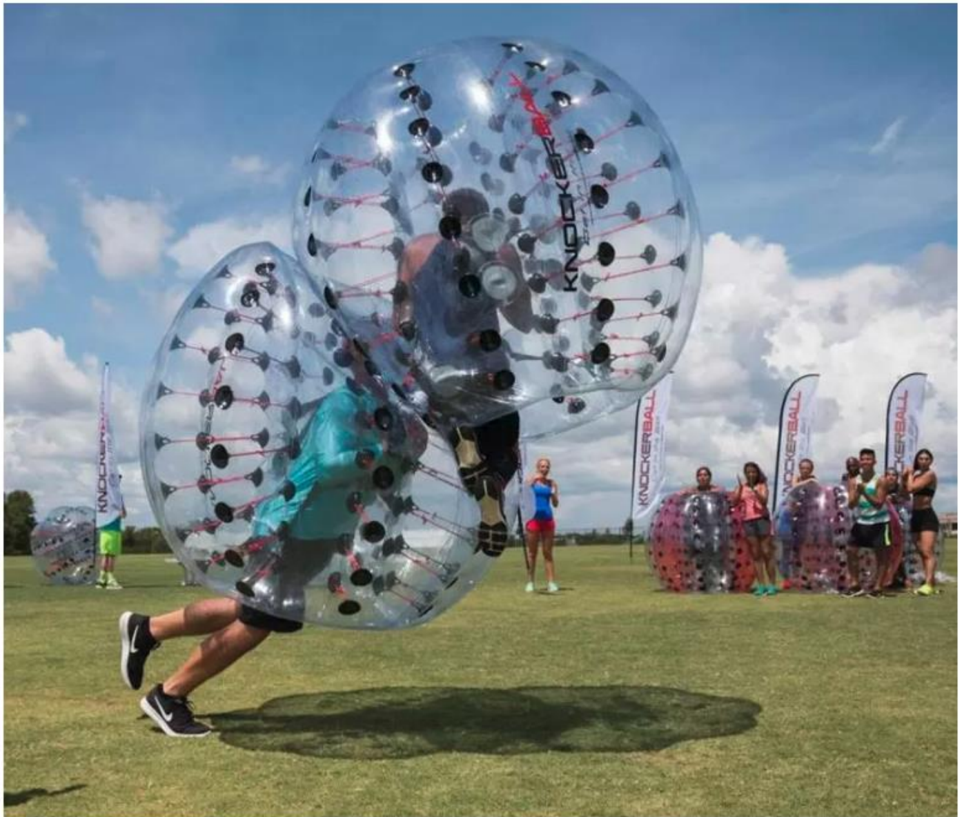
Knockerball at Cranmore Mountain Resort.