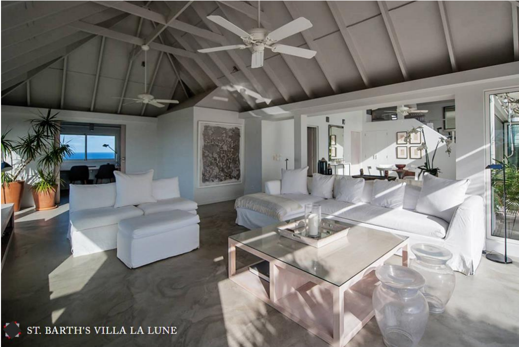
ST. BARTH'S VILLA LA LUNE