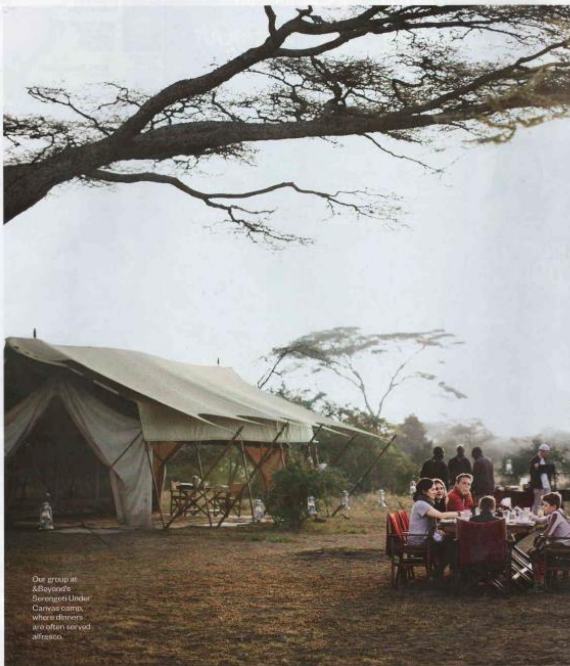
Our group at &Beyond's Serengeti Under Canvas camp, where dinners are often served alfresco.