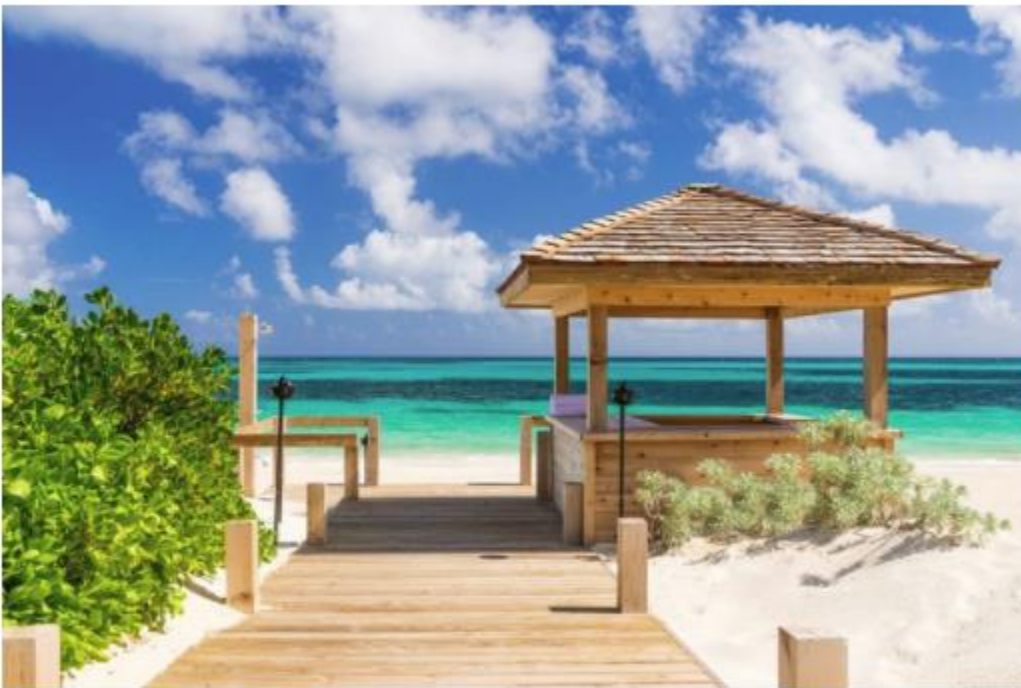
The boardwalk at Sailrock Resort, on storm-hit South Caicos in the Turks and Caicos; the resort is scheduled to reopen in December. Sailrock Resort

The long-anticipated Park Hyatt St. Kitts opened Nov. 1 with a new spa from the Tucson-based Miraval Life in Balance Spa. The 126-room resort has two swimming pools, including one for adults, and three restaurants. The nearly 38,000-square-foot spa will house nine treatment rooms and a yoga and meditation area within a replica sugar mill. Rooms from $450; stkitts.park.hyatt.com . Across the channel on Nevis, Paradise Beach Resort , a boutique property with seven villas, plans to expand with five more beach houses in December. The new two-bedroom units, raised on stilts above the resort's private beach, will have blue-tiled plunge pools, wraparound porches and ship bells that guests ring to call for a concierge. Rates start at $1,495; paradisebeachnevis.com .