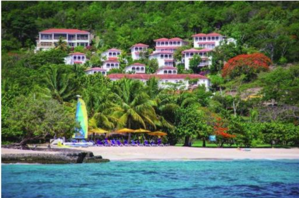
In Grenada, Mount Cinnamon Resort & Beach Club has added eight new suites for a total of 28 rooms and villas. Mount Cinnamon Resort

While tourism recovers on Dominica, a popular Caribbean destination for adventure seekers, Natural World Safaris will focus on one of its offshore attractions, the annual return of sperm whales. Patrick Dykstra, a photographer for the BBC, will guide the seven-day trips with six departures, January through March. A portion of the proceeds will go to disaster relief. Trips start at $7,500 a person; naturalworldsafaris.com .