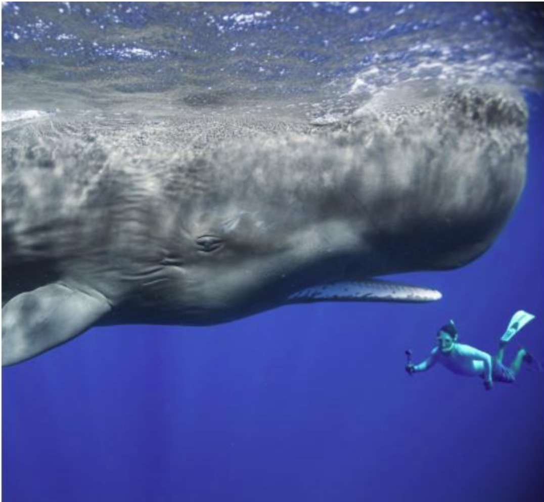
A Natural World Safaris trip will focus on sperm whales off Dominica; this year, a portion of the proceeds will go to storm relief.