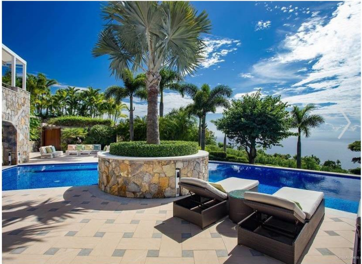
Grande Maison des Etoiles enjoys 360-degree ocean views.

ORIGINALLY PUBLISHED ON MARCH 16, 2017 | MANSION GLOBAL | SAVE ARTICLE