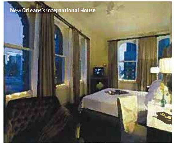
New Orleans's International House