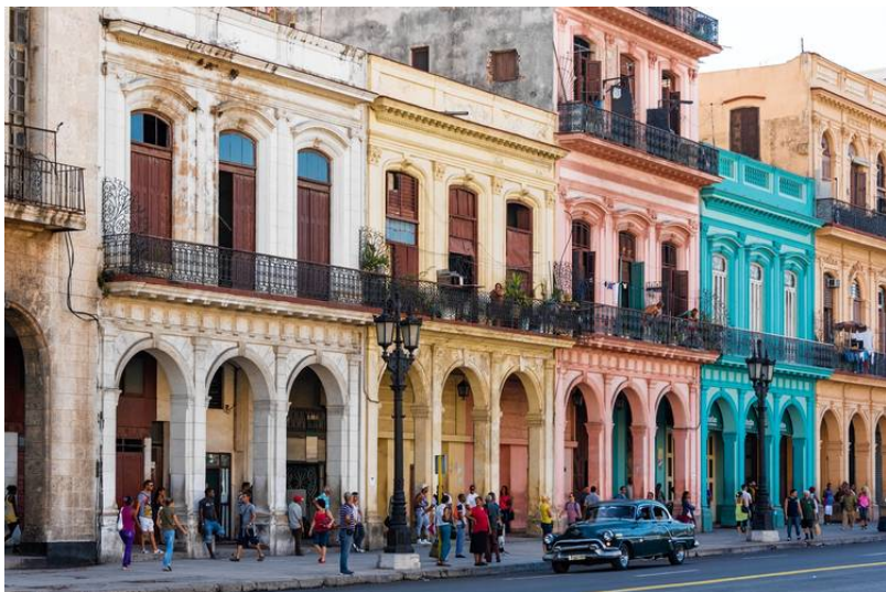
A scene in Havana, Cuba

With Pokémon Go city tours now on offer everywhere from San Francisco to Reykjavik, it was inevitable that tour operators would start plotting entire vacations around the augmented-reality mobile game. The travel company Zicasso now sells bespoke Pokémon-inspired trips through Australia and/or New Zealand, designed with families in mind. A private guide will show travelers around, say, Sydney Harbour or Milford Sound, while giving tips on hunting down Pokémon, including Australasia's resident Kangaskhan. For parents who shudder at the thought of a Pokémon vacation—imagining a glut of screen time and gazillion dollars of cellphone charges—there's good news: All itineraries are customizable, so you can spend ample time cruising along the Great Barrier Reef or other places still too remote for Pokémon. And Zicasso is offering a portable hot spot for travelers who book by Oct. 1, 2016 and travel by Dec. 31, 2017 ( from $2,499 a person for a 7-day trip; zicasso.com ).