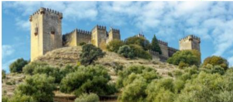
The Castillo de Almodovar del Rio in Cordoba, Spain.

Last week, the U.S. Department of State sent out a travel alert concerning Europe, stating that there's continued threat of terrorist attacks throughout Europe. The travel alert, which expires on Nov. 30, 2017, might deter some U.S. travelers from visiting Europe, but according to data released by Virtuoso during last month's Virtuoso Travel Week —prior to the travel alert—six of the top 10 slots where upscale Americans are heading this fall and holiday season are in Europe.