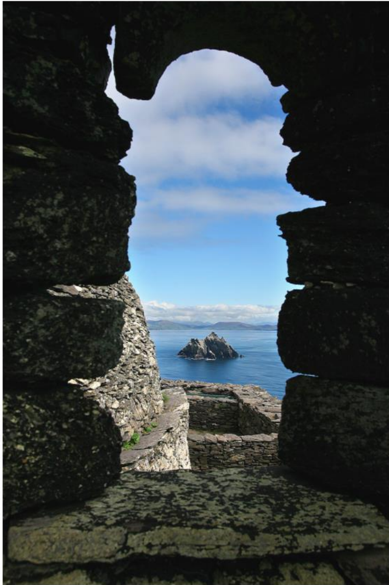
SKELLIG MICHAEL