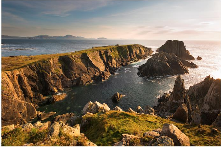
MALIN HEAD