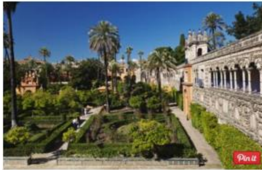
Alkazar is the setting for "Game of Thrones" city Dorne.