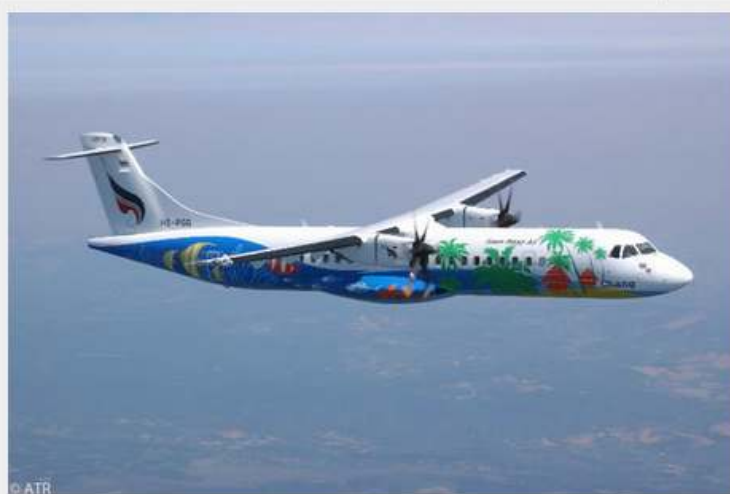
Bangkok Airways operates eight 70-seat ATR 72-500 turboprops on domestic routes within Thailand and flies seven Airbus A319s and three A320s on international routes within Asia

Under the deal, Helsinki-based Finnair is placing its 'AY' flight code on Bangkok Airways' flights linking Bangkok with Koh Samui, Phuket and Chiang Mai, as well as on Bangkok Airways' Singapore-Koh Samui and Hong Kong-Koh Samui services.