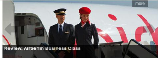
Review: Airberlin Business Class

November 26: Alaska Airlines has launched a fare sale for travel after the holidays. One-way sale fares start at $49 from Reno to San Jose (California), $59 from Seattle to San Francisco and $159 from Oakland to Maui and there are many other sale fares at the same or similar prices. Tickets must be purchased by December 3 for travel between January 8 and March 6, 2013. However, travel on sale fares ends on February 11 to Hawaii from markets outside of California and on February 21 to La Paz, Mexico. Fares require a 14-day advance purchase, except for travel to and from Mexico and Hawaii, for which there is no advance purchase. More information, including a complete list of fares, blackout dates, and complete terms and conditions, is available at www.alaskaair.com or by calling 1-800-ALASKAair (800-252-7522 or TTY/TDD line 800-392-0228).