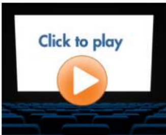
Video: Angry Birds Asian Challenge

Finnair is seeking the most ardent fans to fly their longest, highest Angry Birds flight to Singapore for the Angry Bird Asian Challenge.