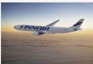
Finnair A330